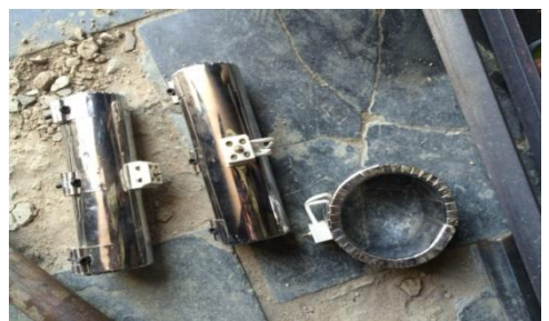
Figure 3.1 Ceramic band heaters

Ceramic band heater which is shown in Figure 3.1 is a type of heater, used to produce heat by positive temperature coefficient. It produces high temperature by consuming low power of 0.9 units for 45 minutes in Barrel heaters and 1.12 units for 45 minutes in die heater. we have used three ceramic band heaters. Two barrel heaters and one die heater is used. Used heater can produce the temperature from the range of 100^{\circ} c to 1300^{\circ} c.