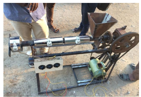
Figure 4.1 Overall assembly

Extruder screw is kept inside the barrel. Barrel is mounted on the frame. Barrel is connected to the gearbox and gearbox gets the power from electric motor through the pulley and belt. Extruder die is kept at the front of the barrel. Heaters are placed around the barrel and the die heater is placed around the die. Three phase AC supply is given for the heaters and single phase AC supply is given for the electric motor. Input plastic is given in the hopper which is attached to the barrel. Analog temperature controller is given to control the temperature of the three heaters used. overall assembly of the machine is shown in the figure 4.1.