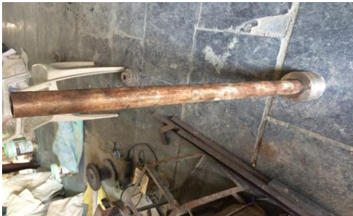
Figure 3.4 Extruder barrel

Barrel is the outer cover for the screw and it has an opening at the rear for the feed from the hopper and at front it has projection for die head. Barrel is made up of hardened steel. Rear of the barrel is coupled with the gear box with help flange coupling. Figure 3.4 shows the fabricated component and the 3d-model is designed in solidworks, it is shown in the figure 3.5