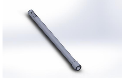
Figure 3.5 CAD model of Barrel

ISSN: 2277-9655 Impact Factor: 4.116 CODEN: IJESS7