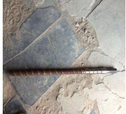
Figure 3.2 Extruder screw

ISSN: 2277-9655 Impact Factor: 4.116 CODEN: IJESS7