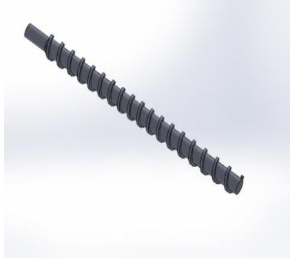
Figure 3.3 CAD model of Screw